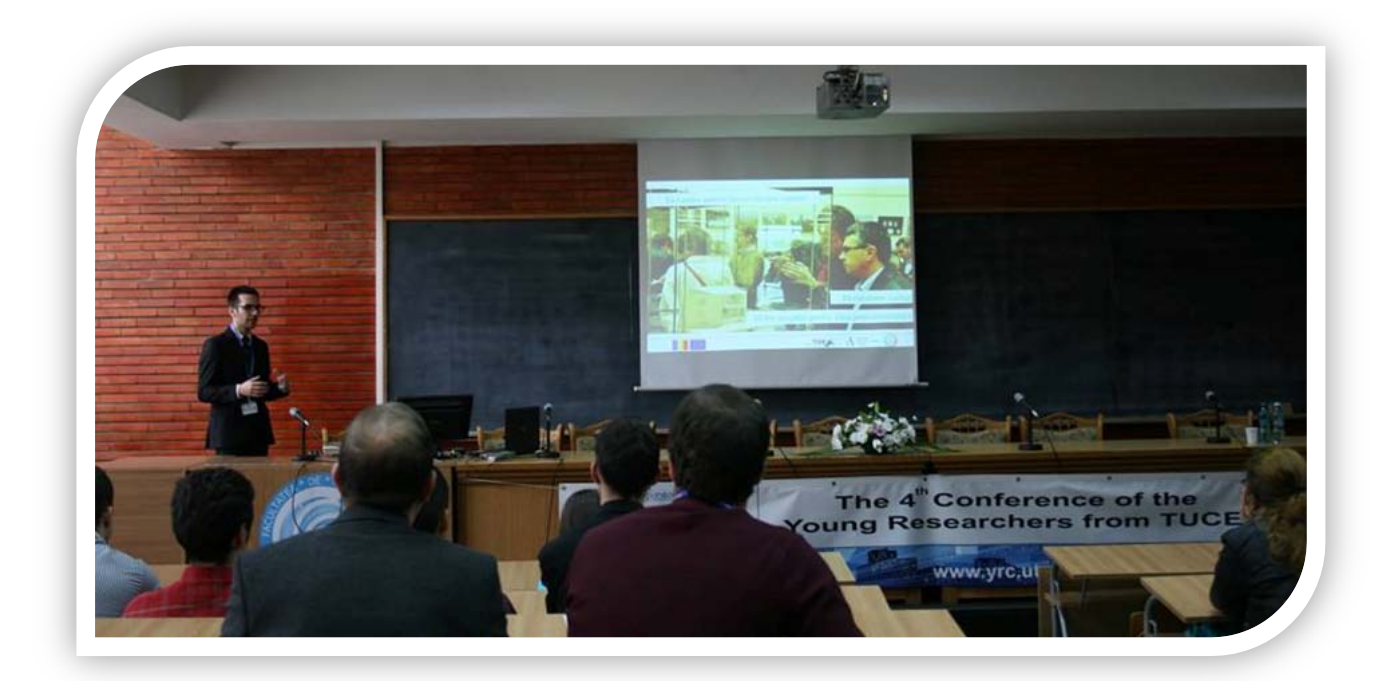
Presentation of the EFdeN Project

In 2013 edition of the YRC conference, the members of the Romanian team (EFdeN) which were participating to 2014 Solar Decathlon competition were our guests. This team, formed by the TUCEB, IMUAU and UPB students and teachers, was the only Romanian team that participated at all Solar Decathlon competitions held until today.