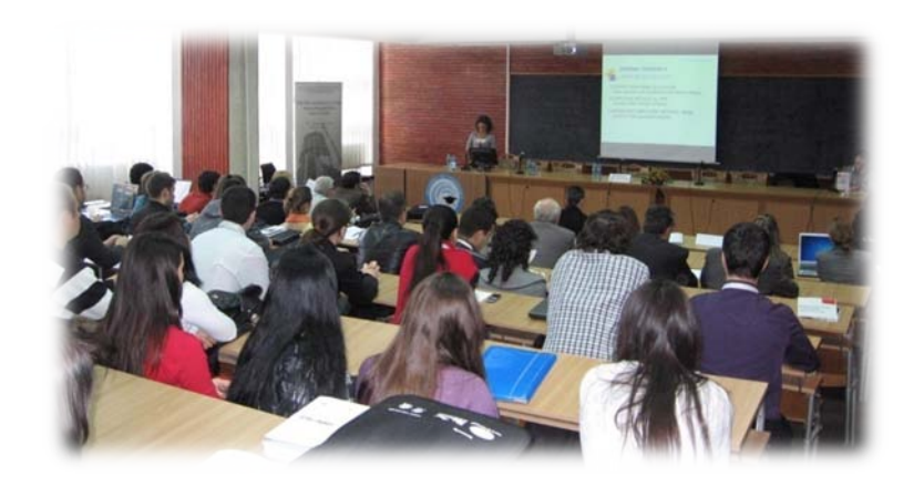
Young researchers conference -YRC 2010

The YRC conference is targeting everybody who is involved in the Civil Engineering domain. A section named Conference Topics, which contains the main topics of the conference, is presented on the web site of this event (<a href="www.yrc.utcb.ro">www.yrc.utcb.ro</a>).