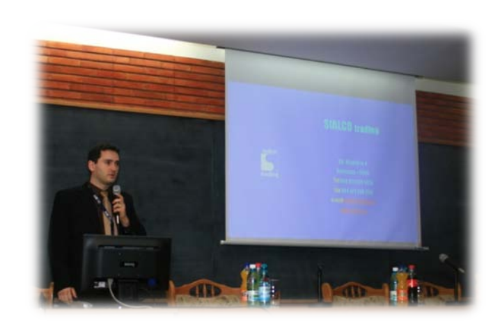
SC SIALCO TRADING SRL