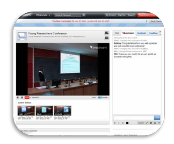
On-line broadcasting - YRC 2011

In order to have a better dissemination of the YOUNG RESEARCHERS CONFERENCE, every edition was broadcasted on-line on the conference web site.