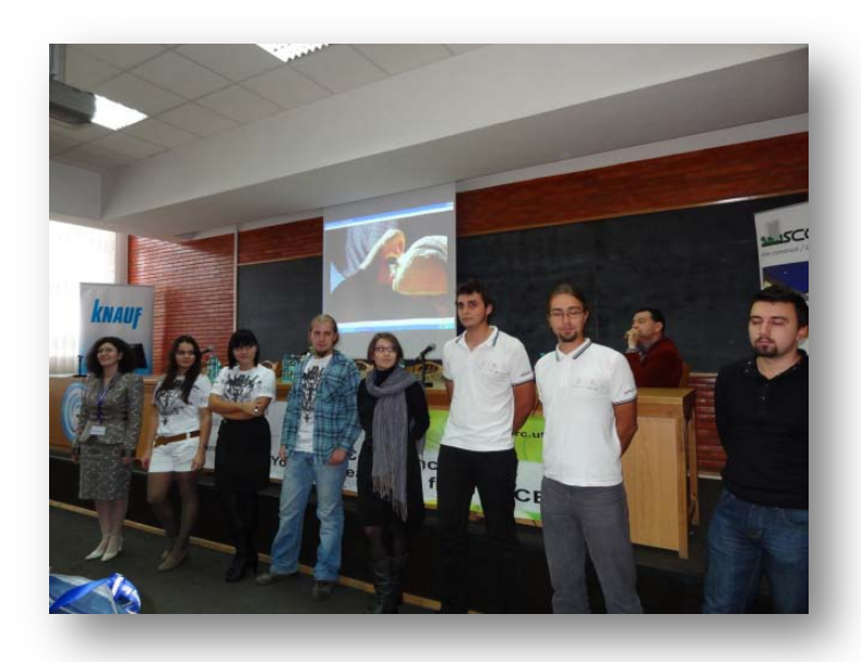
PRISPA team at YRC 2012

In 2013 edition of the YRC conference, the members of the Romanian team (EFdeN) which were participating to 2014 Solar Decathlon competition were our guests. This team, formed by the TUCEB, IMUAU and UPB students and teachers, was the only Romanian team that participated at all Solar Decathlon competitions held until today.