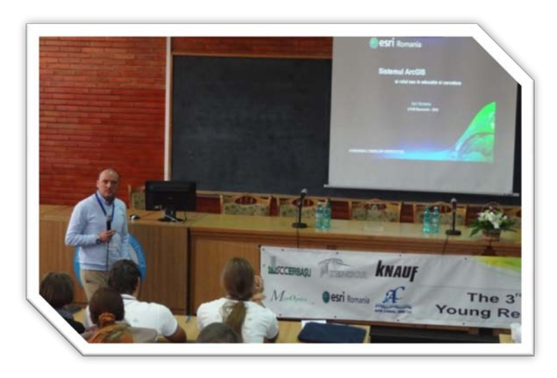
SC ESRI ROMÂNIA SRL