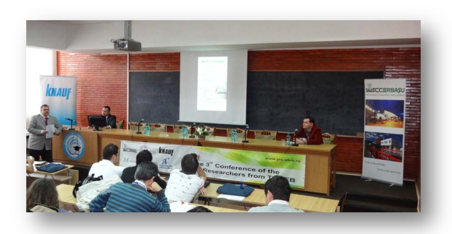
SCC ERBAŞU SA