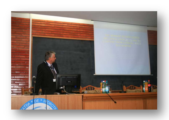
SC APA CANAL 2000 PITEŞTI SA