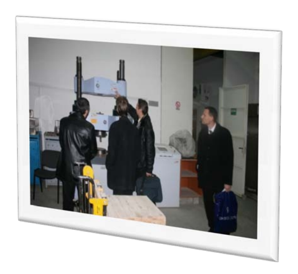
Research facilities from TUCEB

In order to have a better dissemination of the YOUNG RESEARCHERS CONFERENCE, every edition was broadcasted on-line on the conference web site.