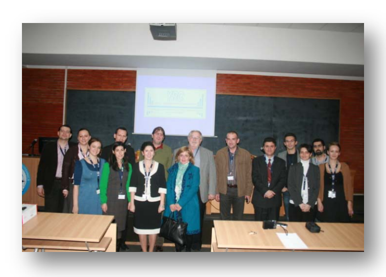
Scientific and Organising Committees - YRC 2011

Every article and presentation is written and presented in English. After a careful selection the accepted articles are divided into two main categories. The articles from the first category are published in the Mathematical Modelling Journal (BDI indexed). The articles from the second category are published in the Conference Proceedings (an electronic ISSN rated publication). Thanks to the help of our sponsor TENSOR SRL, on every edition, the best articles and the best presentation have been awarded with nice prizes.